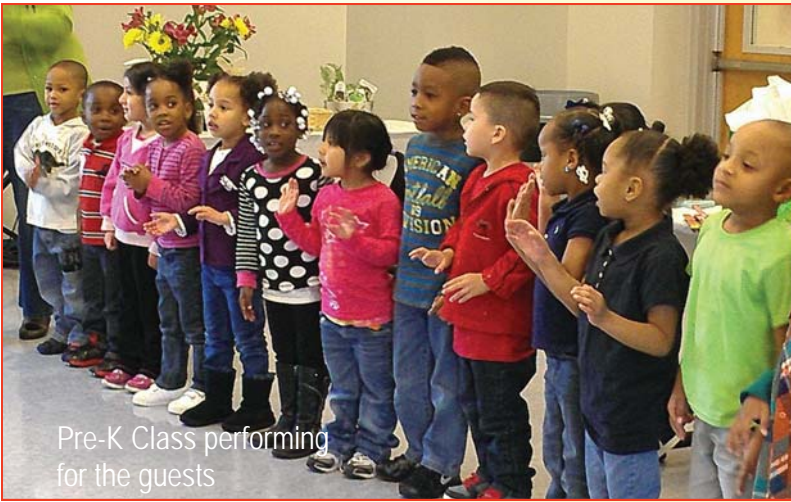
Pre-K Class performing for the guests