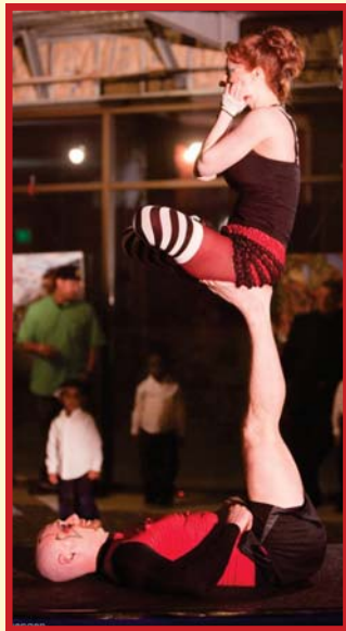
Human Art in Motion