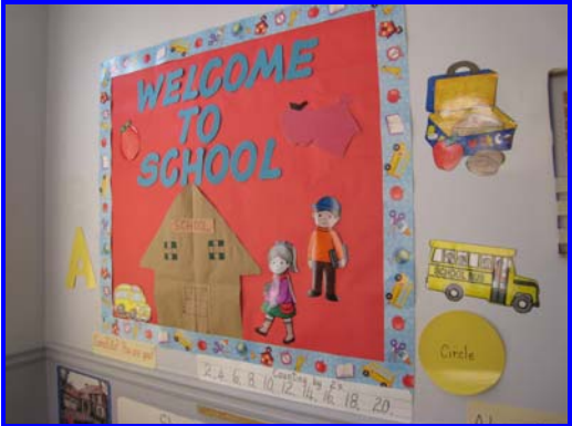
Beacon of Hope