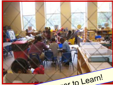
Ready & Eager to Learn!