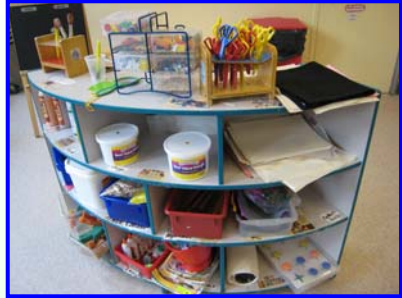
New Art Supplies!