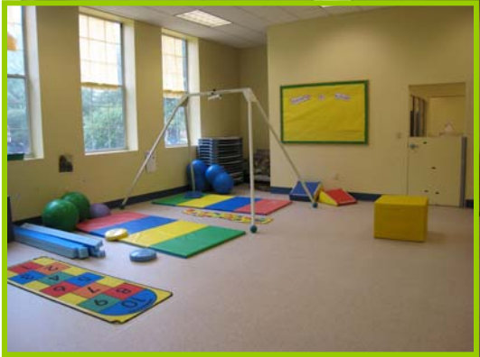
Sylvan Hills Special Needs Room

Sylvan Hills Child Development Center is in its third year of the TEACCH Program. It has added an assistant teacher who comes with specialized training in working with children with autism. TEACCH is an evidence-based service, training, and research program for individuals of all ages and skill levels with autism spectrum disorders.