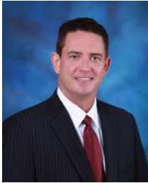
Bobby Cagle Commissioner—Bright from the Start—DECAL

Congratulations to the Georgia Department of Early Care Learning (DECAL) as it celebrates the 20th Anniversary of Georgia's Pre-K Program.