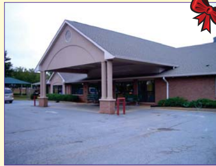
Mansell Easter Seals Child Development Center