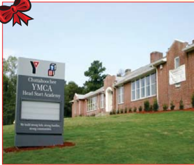
Chattahoochee YMCA Head Start Academy