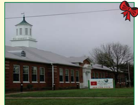
Sylvan Hills Easter Seals Child Development Center