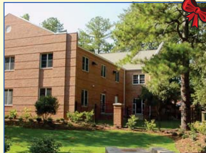
Brookvalley Easter Seals Child Development Center