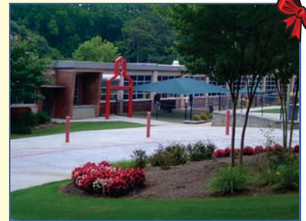
Guice Easter Seals Educare Center