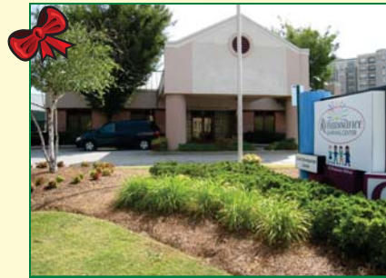
Beacon of Hope Renaissance Learning Center