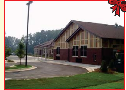
Paulding YMCA Early Learning Academy