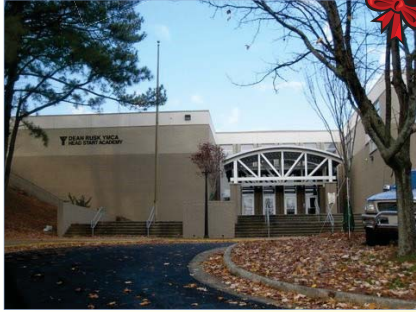
Dean Rusk YMCA Head Start Academy