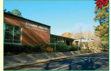
College Heights Early Childhood Learning Center