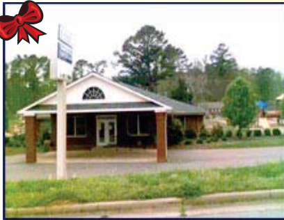
Tendercare Preschool & Daycare Academy